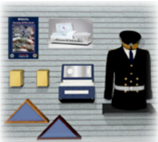
AURORA Veterans Casket Display

BY USING THE THIRTEEN FOLDS VETERANS PROGRAM AND ITS UNIQUE MARKETING TOOLS